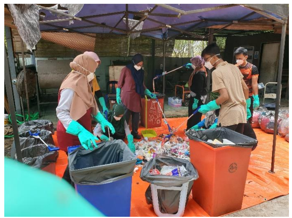
Waste segregation activities