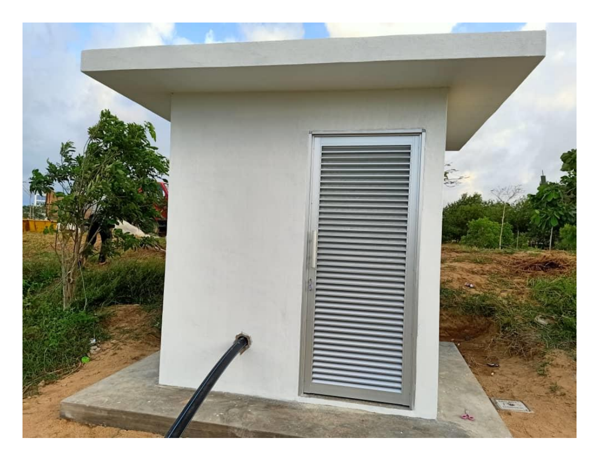
Water pump house at Lake A