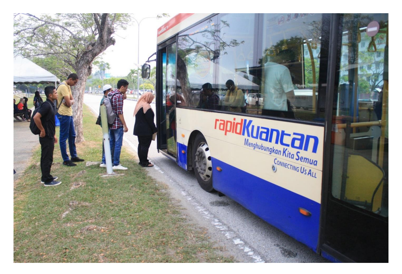
Public transport facility at both campuses